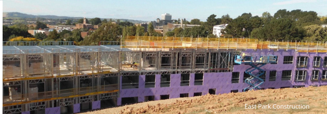
East Park Construction

"It was great to work with a single source steel company who could offer us a complete service for all our steel needs, from heavy and light steel sections, to profiles and folded durbar."