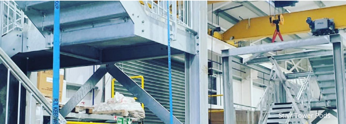
Stair Tower Pods

Taunton Fabrication Limited chose ParkerSteel Limited to provide steel for the internal balustrade, wall handrails, external link bridges and stair towers throughout the whole project.