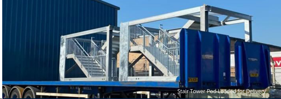
Stair Tower Pod Loaded for Delivery