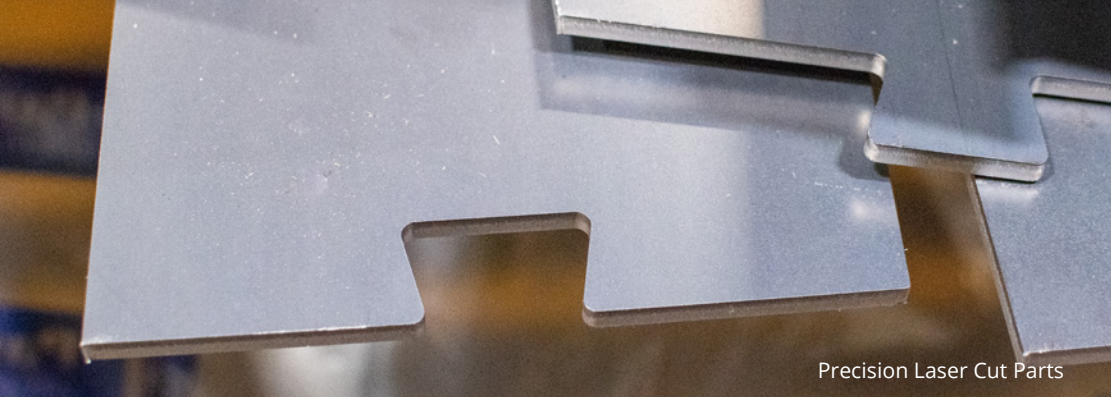
Precision Laser Cut Parts