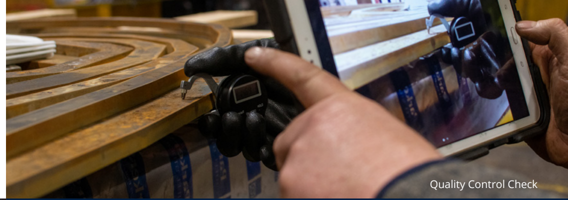
Quality Control Check

The ParkerSteel processing team used waterjet and laser technology to cut over 280 components, which were all marked and packaged for convenient assembly at Littlehampton Welding Ltd.