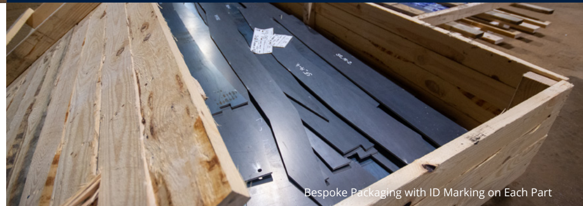
Bespoke Packaging with ID Marking on Each Part

Littlehampton Welding Ltd chose ParkerSteel to collaborate on this fascinating project, where the 17 meters long whale sculpture, that is made of our steel, represents all life on earth that is not human and demands some of our public space for itself.